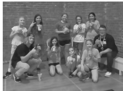
ACS girls' team